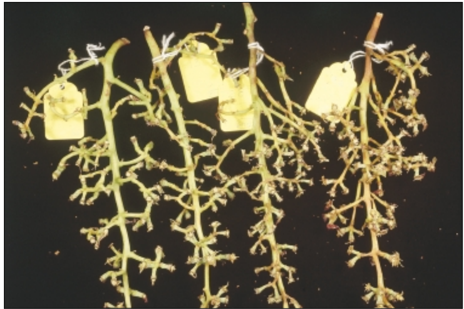
Flame Seedless table grape stem condition after 0, 3, 6 and 9 hours delayed cooling (79°F, 30% rh and 25 fpm air velocity) followed by 7 days cold storage (32°F, 95% rh and 10 fpm air velocity).

stems with moderate and severe symptoms (table 2). Also, stems with moderate symptoms had lost less of their harvest fresh weight than stems showing severe symptoms. Perlette, Flame Seedless and Thompson Seedless stems had to lose 16.5%, 14.4% and 15.1%, respectively, of their water content before showing cap stem dehydration symptoms. Fantasy Seedless and Redglobe stems needed to lose more than 20% of their water content before showing cap stem dehydration symptoms (table 2). Redglobe stems had moderate to severe stem browning after losing 36% of their water content. Perlette, Flame Seedless, Thompson Seedless and Fantasy Seedless had moderate to severe stem browning symptoms when they lost more than 25% of their stem water content. The fact that Flame Seedless grapes were the first to show dehydration symptoms with 14% stem water loss indicates that this cultivar is more sensitive to stem browning than the others. In contrast, Fantasy Seedless and Redglobe experienced higher levels of stem water loss than Perlette, Flame Seedless and Thompson Seedless be-